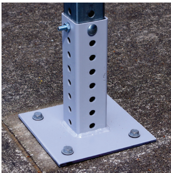
Surface mount base anchor.