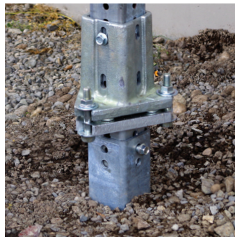
Slip base system. Available in 8" and 10" triangular slip bases.